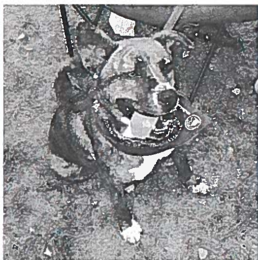
GINGER LOOKING HEALTHY AND WELL FED AFTER BEING BROUGHT IN TO THE WCHS.

Ike and Ginger, warrant requested and granted, charges filed and case was won in favor of WCHS. Ike and Ginger were starved, 50 percent underweight and living in filthy conditions.